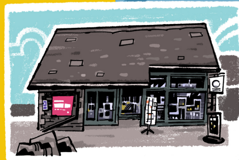
Bowness Bay National Park Information Centre