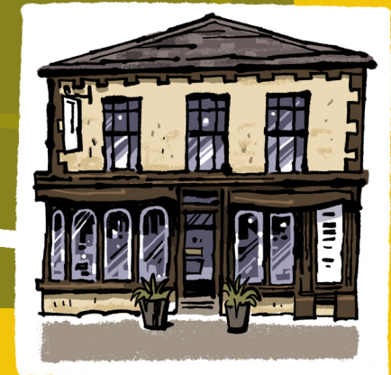
Bryson's in Bowness-on-Windermere