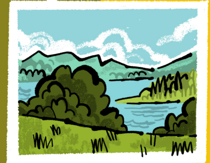
Queen Adelaide's Hill

JOIN ME AT THE INFORMATION CENTRE ON GLEBE ROAD AND FOLLOW THE TRAIL ALL THE WAY TO QUEEN ADELAIDE'S HILL TO MEET THE WOODLAND SAGE